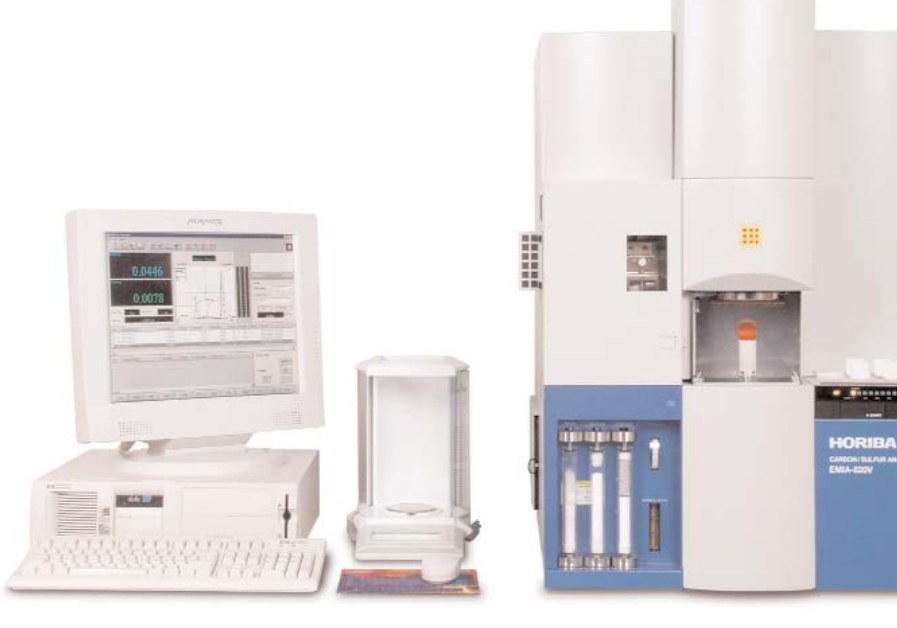
Figure 1: EMIA 820V

The high frequency or induction furnace is equipped with a plate current control function. This allows users to easily optimize the temperature according to the samples. Some customized temperature curves can be created in order to observe various phenomena such as surface con-