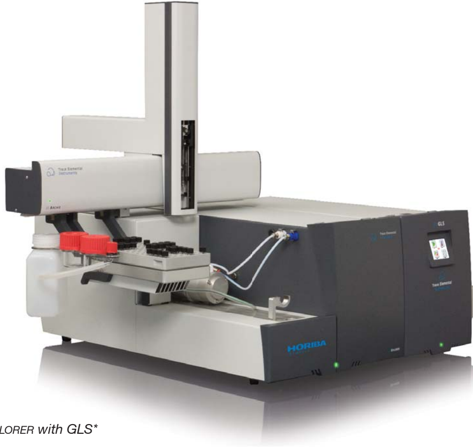
Configuration: XPLOER with GLS*

The XPLOER-TX/TS is a microcoulometric combustion analyzer for the analysis of total halogens and total sulfur. The small footprint allows it to blend into every laboratory environment, whether it is in R & D, a refinery, a chemical or petrochemical application. This elemental analyzer will perform well. It is robust, precise and ideal for harsh testing environments.